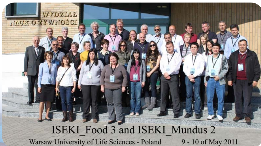
ISEKI_Food 3 and ISEKI_Mundus 2